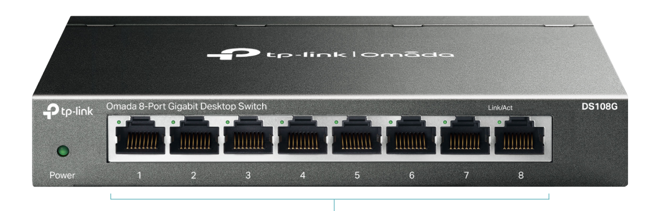
8 × Gigabit RJ45 Ports