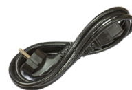
2x IEC cord